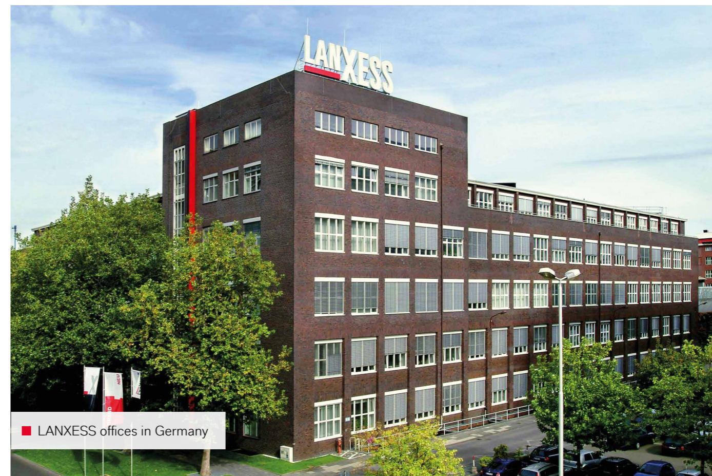
■ LANXESS offices in Germany